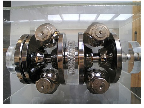
Toroidal CVT used in the <u>Nissan</u> Cedric (Y34)

Toroidal CVTs, as used on the 1999 <u>Nissan Cedric (Y34)</u>,<sup>[8][9]</sup> consist of a series of discs and rollers. The discs can be pictured as two almost conical parts, point to point, with the sides dished such that the two parts could fill the central hole of a torus. One disc is the input, and the other is the output. Between the discs are rollers which vary the ratio and which transfer power from one side to the other. When the roller's axis is perpendicular to the axis of the discs, the effective diameter is the same for the input discs and the output discs, resulting in a 1:1 drive ratio. For other ratios, the rollers are moved along the axis of the discs, resulting in the rollers being in contact with the discs at a point which has a larger or smaller diameter, giving a drive ratio of something other than 1:1.<sup>[10]</sup>