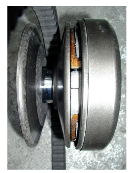
Belt-driven CVT for a motor scooter

In a chain-based CVT a film of lubricant is applied to the pulleys. It needs to be thick enough so that the pulley and the chain never touch and it must be thin in order not to waste power when each element